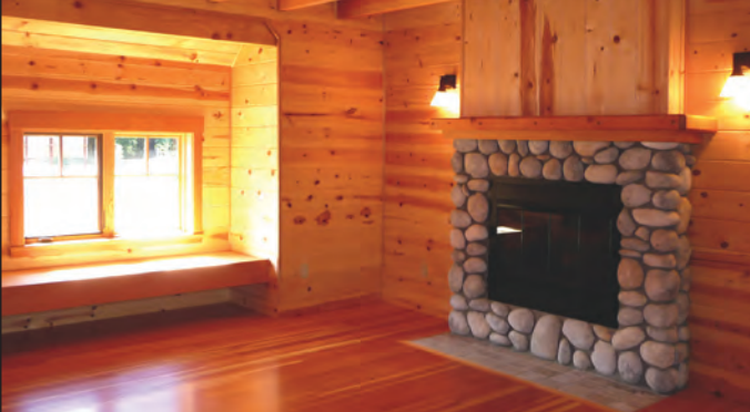
1 Bedroom and Loft / 1.5 Bathrooms