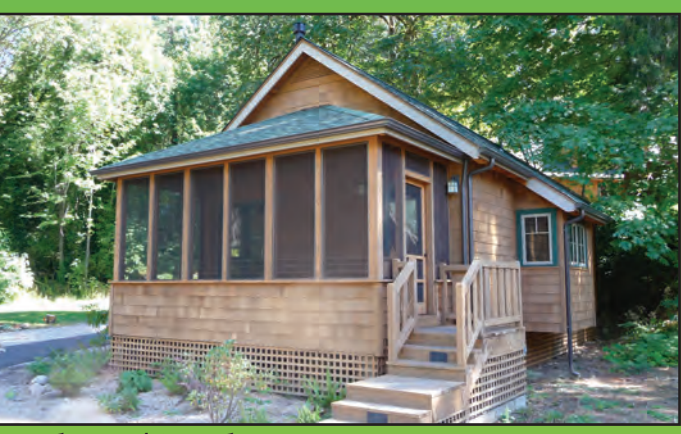
1 Bedroom / 2 Bathrooms

•One and two bedroom cabins with open-beam construction with knotty pine and fir interiors •River rock gas fireplaces with fully-equipped kitchens