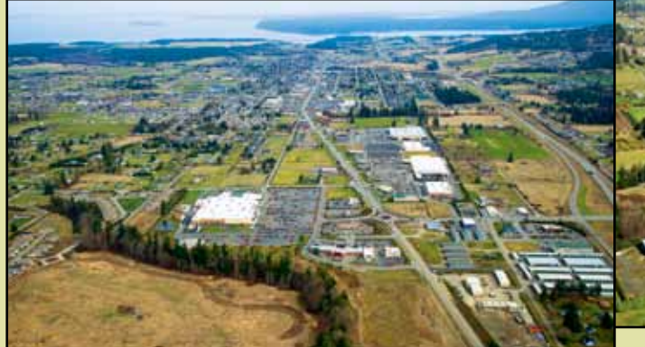
5.44± acre development site by Costco in Sequim, WA