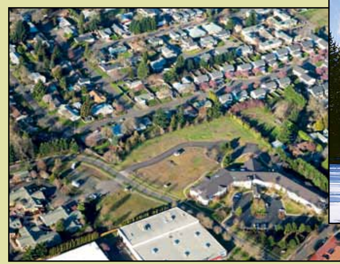
1.61± acre development site in Eugene, OR