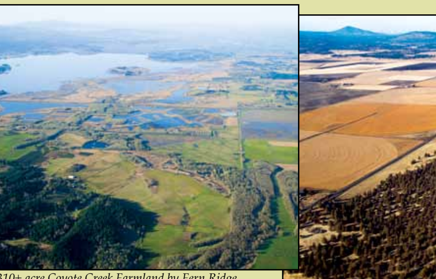
310± acre Coyote Creek Farmland by Fern Ridge Reservoir in Lane County, OR

4,838± acre Foresthill Timber Tract in Placer County, CA