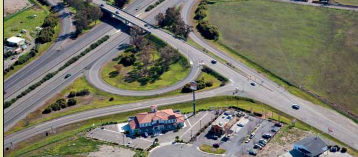
Retail and office building at I-5 in Orland, CA