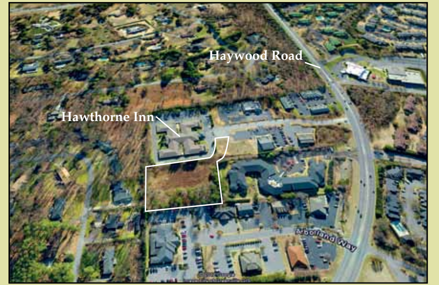
1.25± acre development site in Greenville, SC