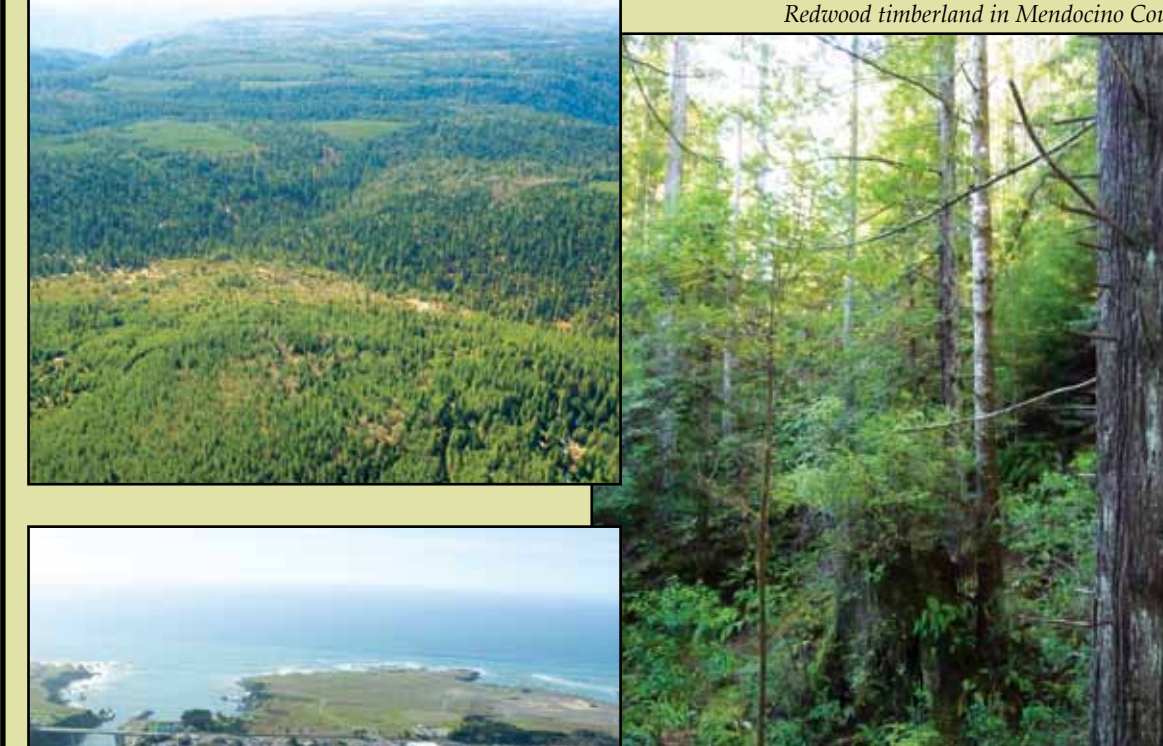
8.17 \pm acre development site in Fort Bragg, CA