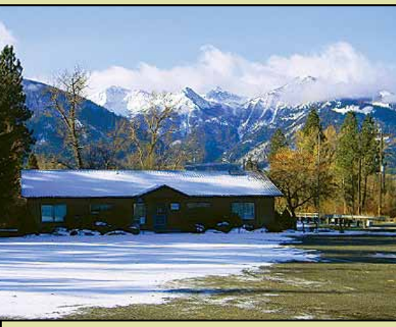
Former forestry office along Wallowa River in Joseph, OR