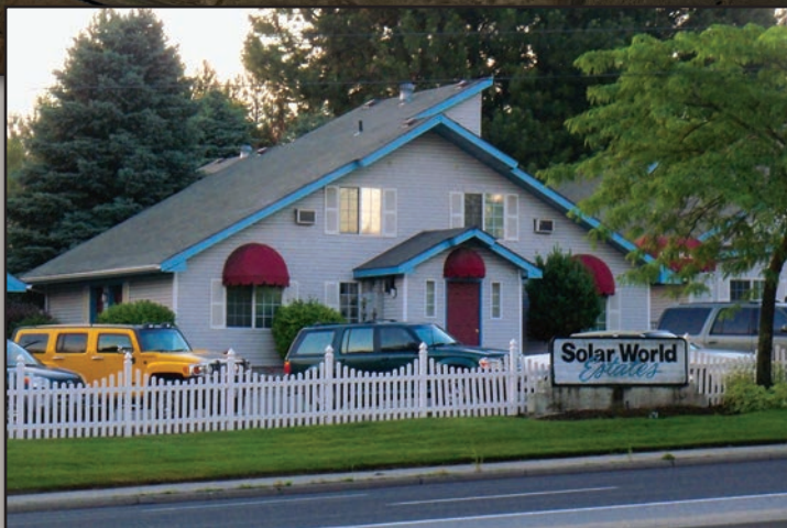
Solar World Estates North contains 32 one bedroom/one bathroom apartments

Solar World Estates North, with 32 units, is located five miles north of downtown Spokane, near NorthTown Mall and Whitworth University, and has excellent access to both Highways 395 and 2 (North Newport Highway).