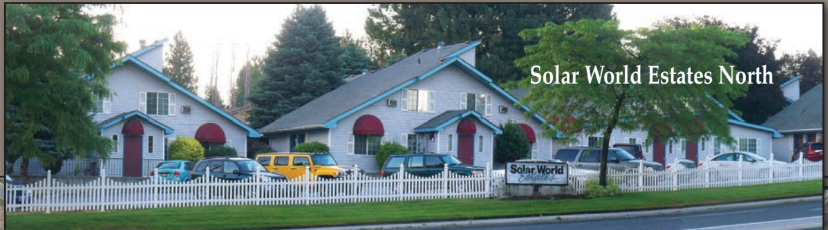
Solar World Estates North