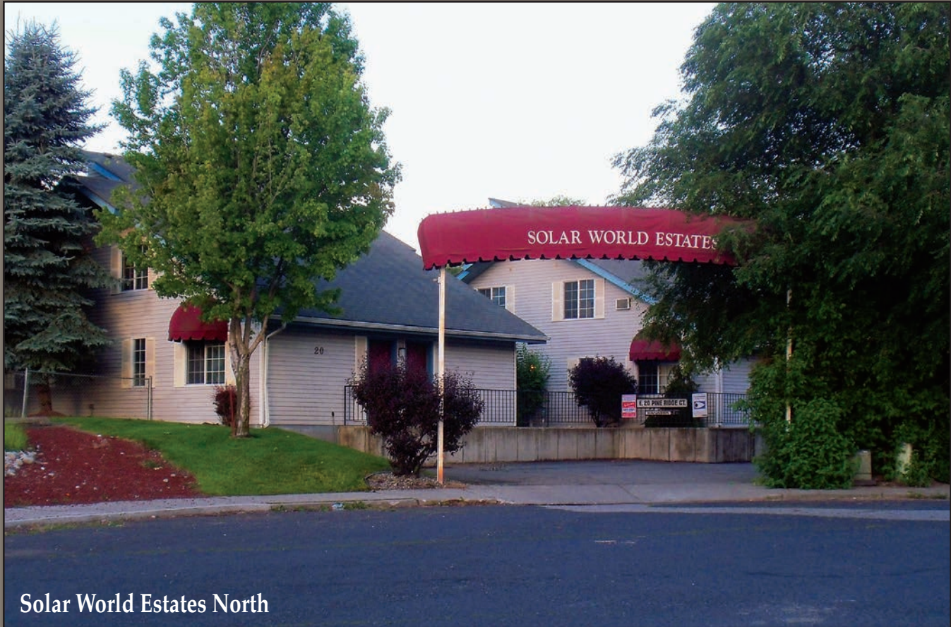
Solar World Estates North