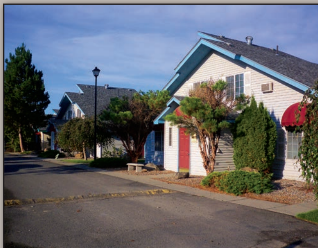
Solar World Estates West

Seventy nine percent of the units at Solar World Estates are one bedroom / one bathroom; the balance is mostly two bedroom / one bathroom, with the exception of one two-bedroom / two bathroom unit, and one three-bedroom / one bathroom unit.