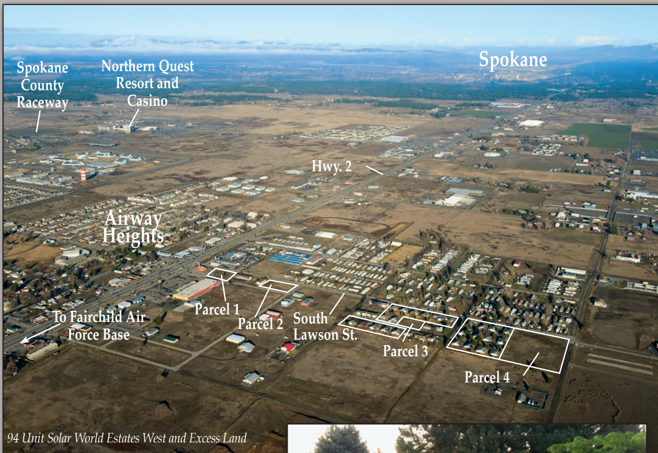
94 Unit Solar World Estates West and Excess Land

The secured lender, under the terms of the Deed of Trust, has initiated a Trustee's Sale, to be conducted on April 12, 2013 at 10 a.m. at the Spokane County Courthouse.