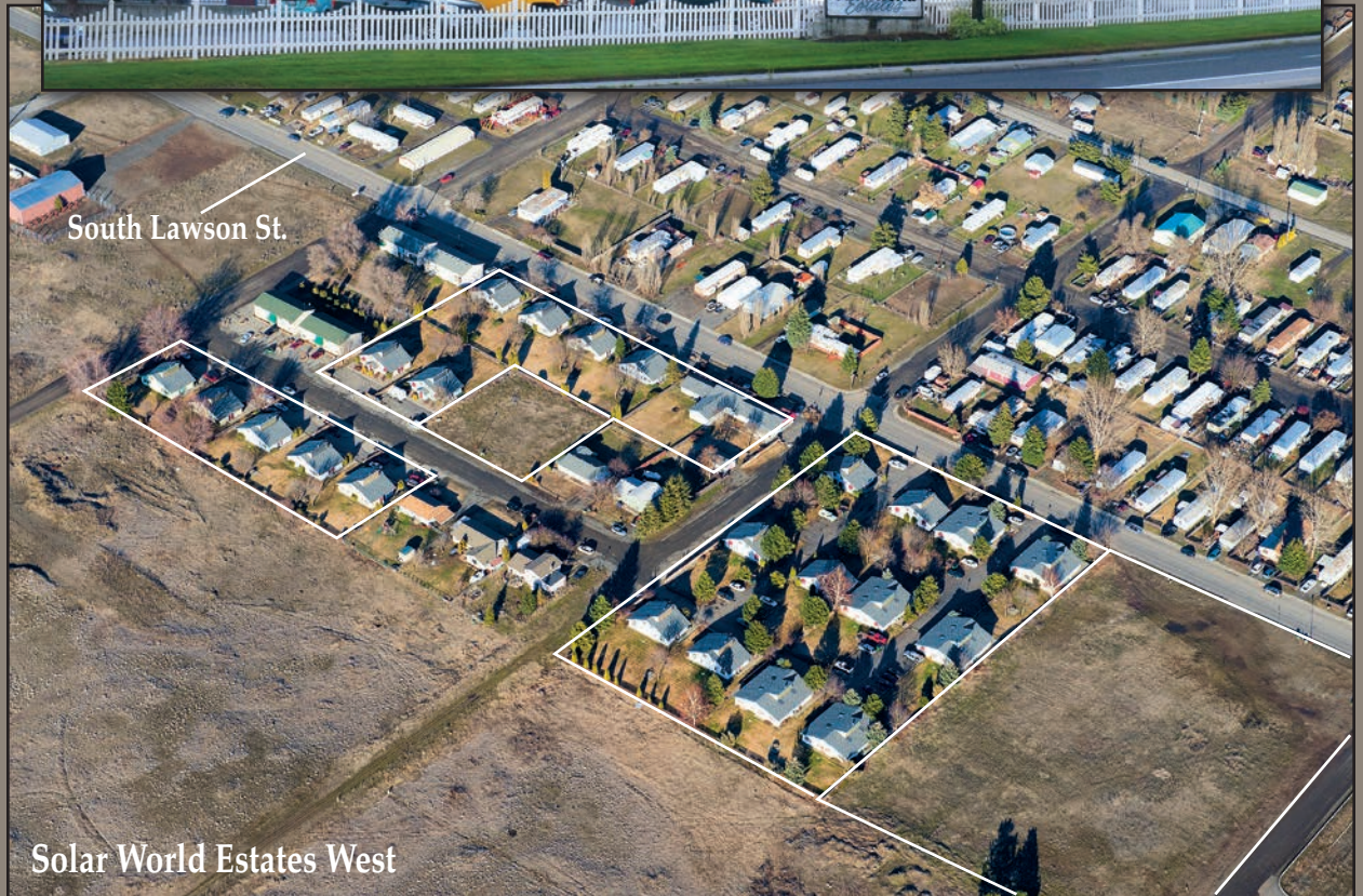
South Lawson St.