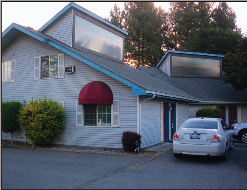
Top: Solar World Estates West was constructed between 1987-1990 with 94 units in 24 four-plex buildings