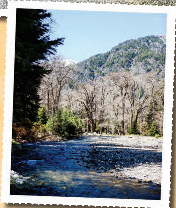
Wallowa River frontage by Lodge