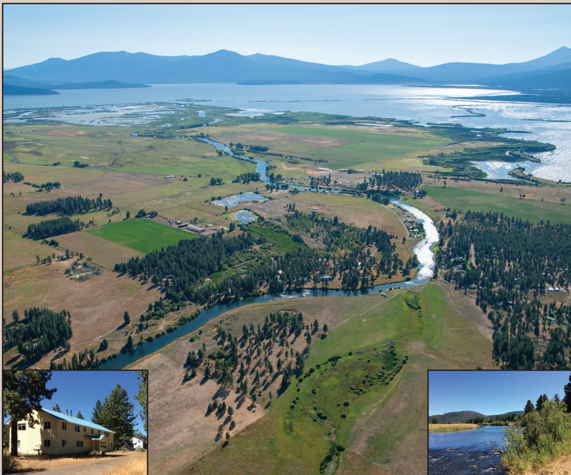
112± acre Kleos Williamson River Retreat within 60 minutes of Crater Lake National Park, with ten buildings. Near Upper Klamath Lake $1,200,000