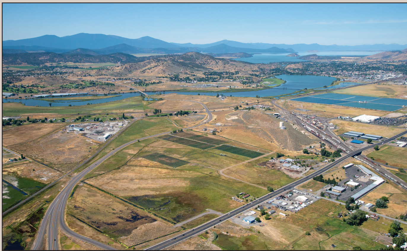
227± acre Southside Bypass tract located in Enterprise Zone. Solar farm, cell leases, permitted rock quarry, and strategic location to Oregon and California markets Klamath Falls, Oregon $1,895,000