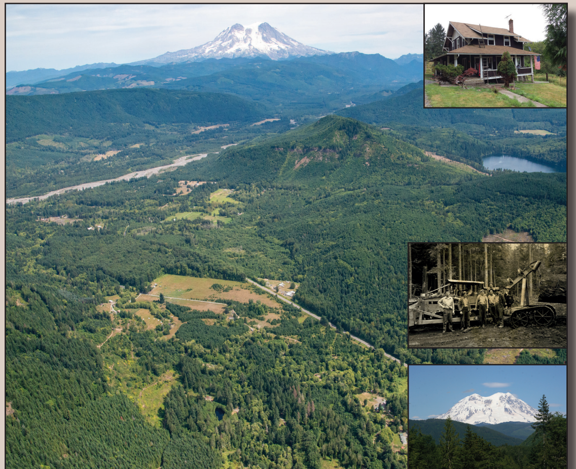
232± acre historic Lutkens Farm with homestead, 2± million board feet of timber and views of Mt. Rainier. Within 20 minute drive of park entry, with Seller financing $2,350,000