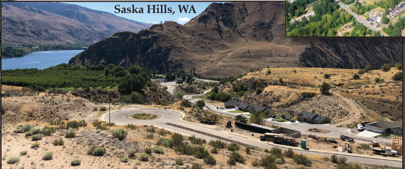
Saska Hills, WA