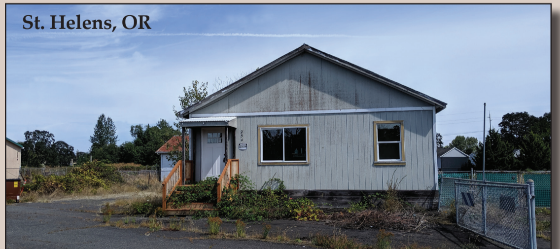
St. Helens, OR