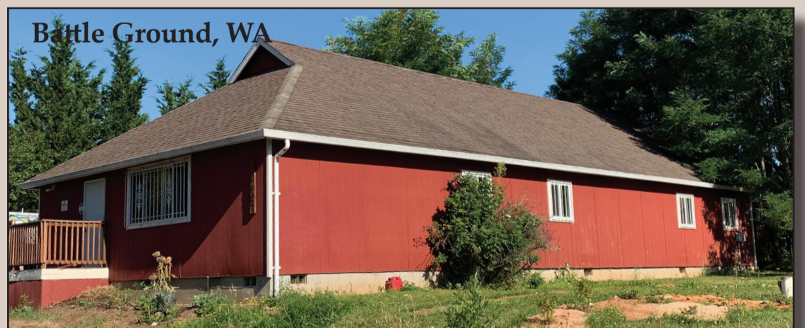
Battle Ground, WA

Four small commercial buildings in Corbett, St. Helens, Pendleton, Oregon and Battle Ground, Washington $75,000 to $185,000