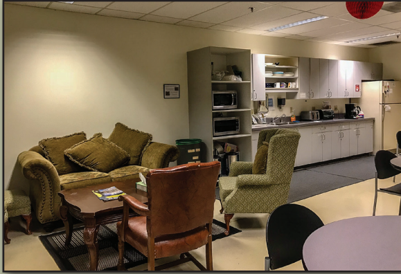
Break room with kitchenette located on main floor, with access to outdoor patio