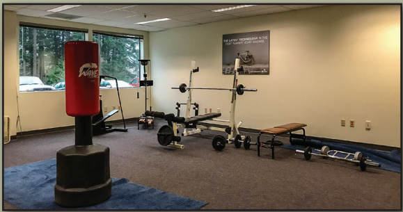
Exercise room located in daylight basement