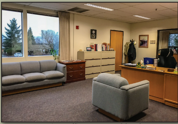
Forest supervisor office on second level