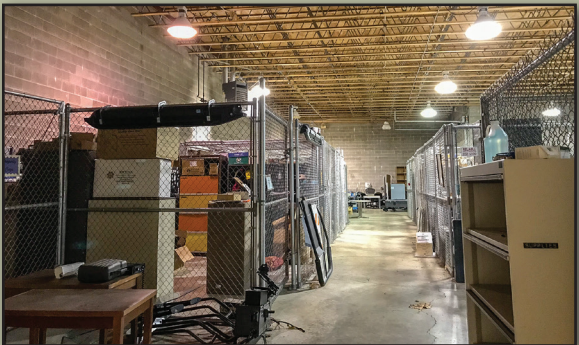
11,048± square feet of warehouse space with ceiling height of 24 feet