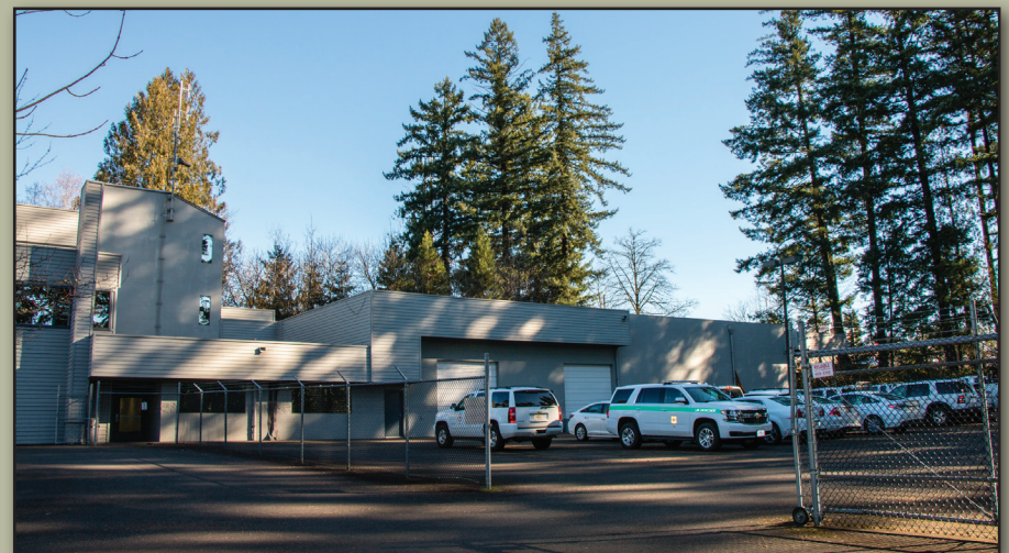
Warehouse space could be expanded to flex space for multiple users