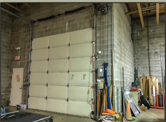
Two roll-up doors and loading dock in warehouse