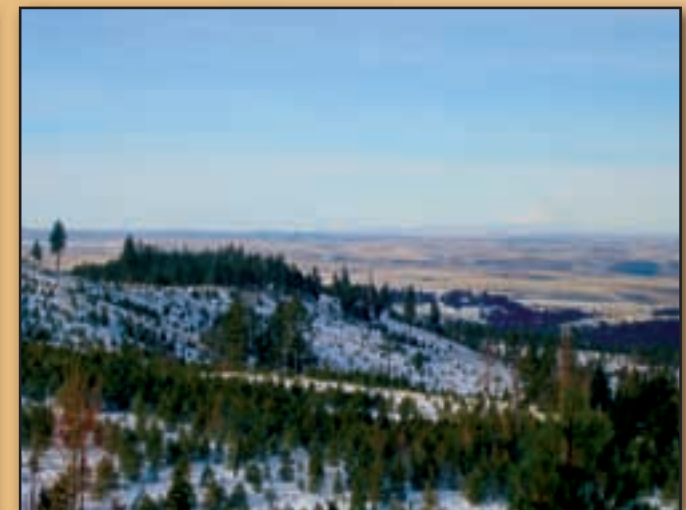
View of Mt. Hood