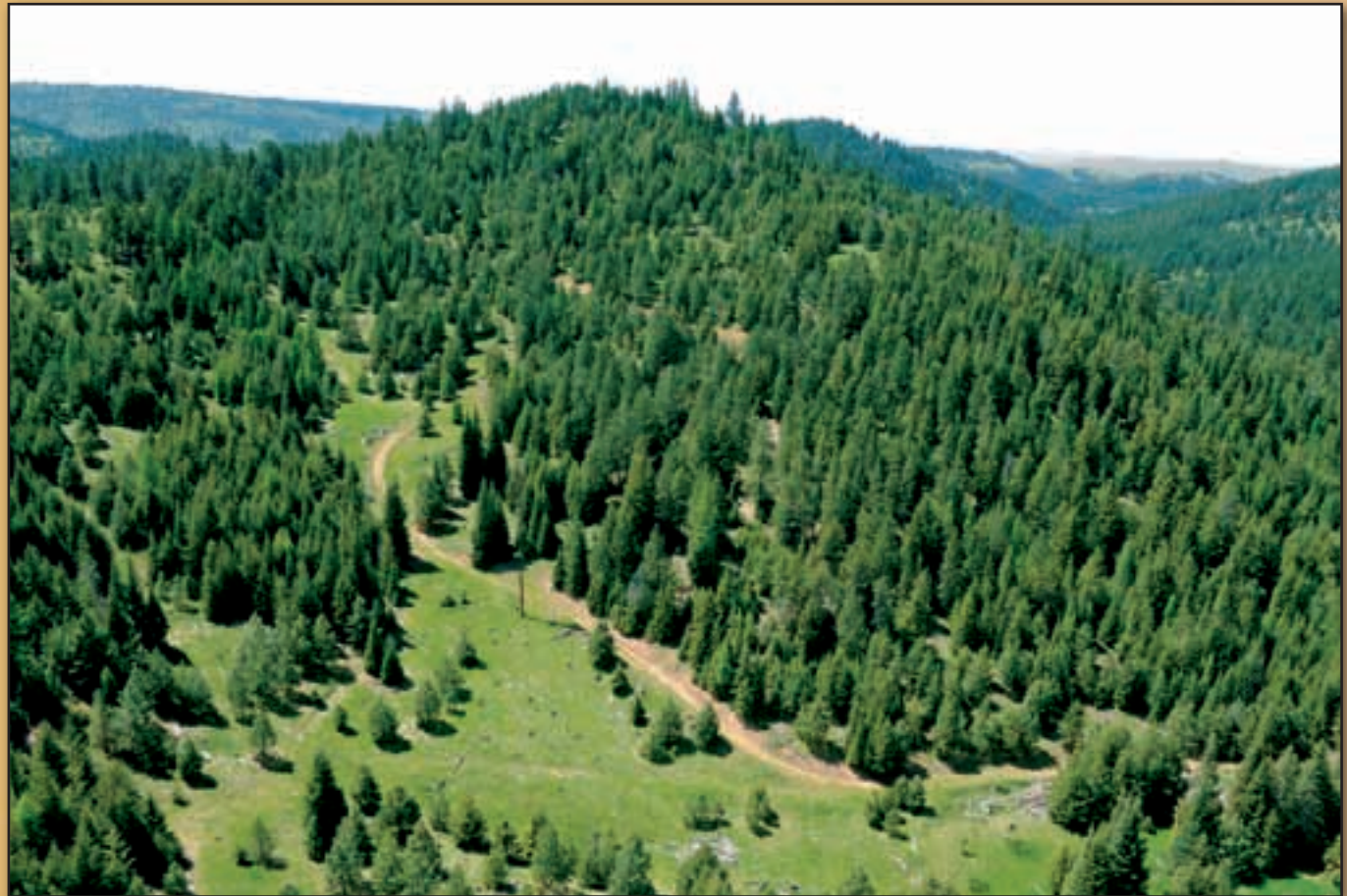
Well-stocked stands in section 6