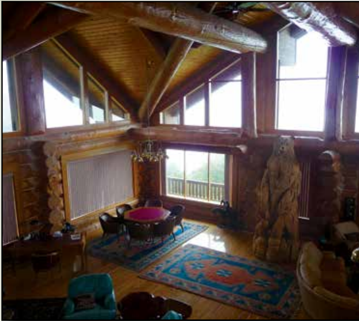
Main floor two-story great room

The property is being sold fully-furnished with art installations throughout, including seven Frederick Remington bronze sculptures.