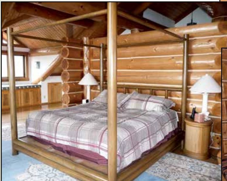
Master suite with deck and loft area