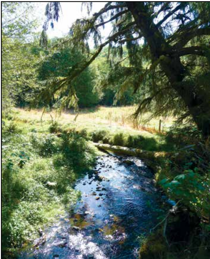
Wolf Creek instream and riparian enhancement project

An updated timber cruise available in the Supplemental Information Package, prepared by Northwest Forestry Resources in August 2012, outlines net merchantable timber volume, by species and grades. There is an estimated 46± acres of 20± to 25± year old well-stocked stand of Douglas-fir, located north of Swab Creek and east of Wolf Creek, ready for pre-commercial thinning. There are several open meadows on the property, providing excellent habitat for elk.