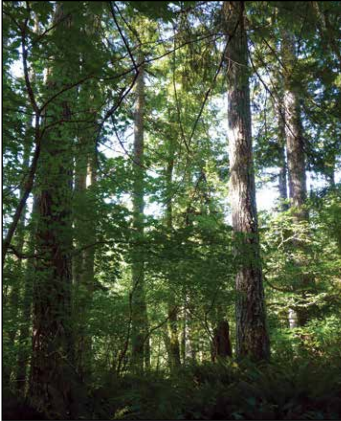
4,646± MBF of primarily Douglas-fir