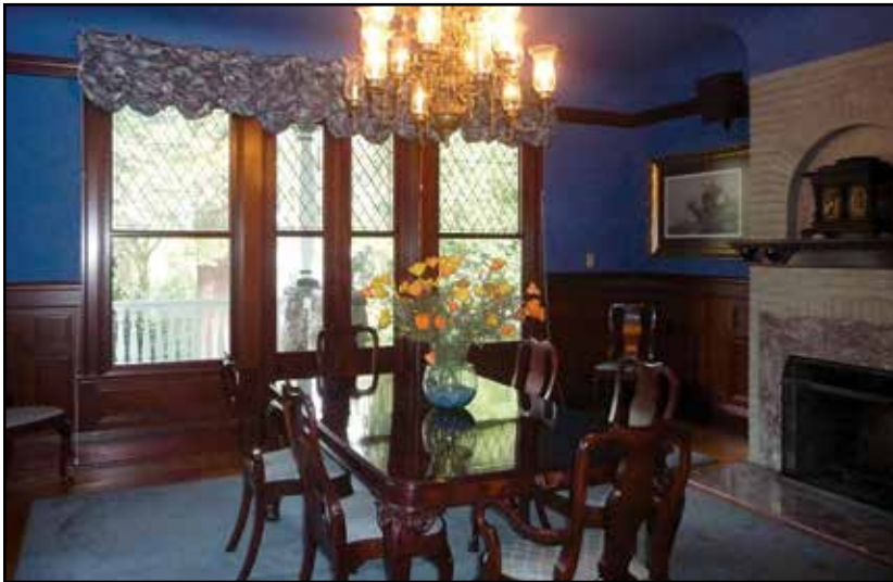
Dining Room with Fireplace