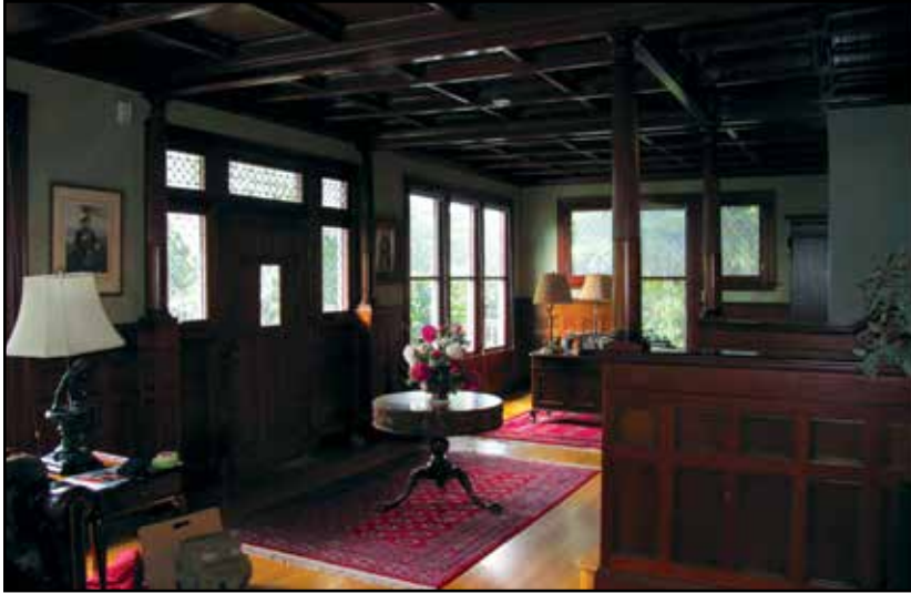
Main Entry Foyer with West Living Room