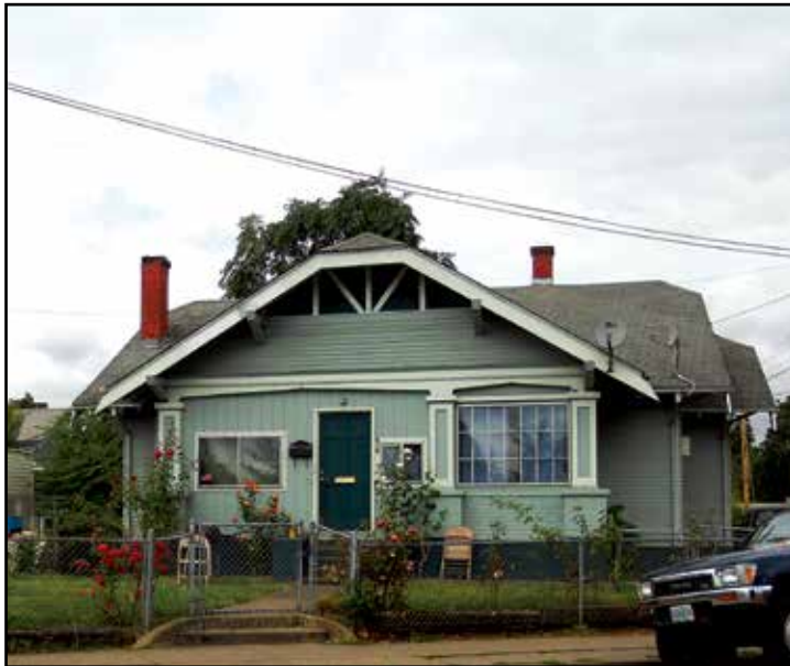
Auction Property #15: two bedroom, one bath home in Eugene