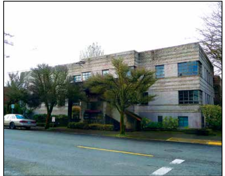
Auction Property #104: 16,455± square foot building near Yamhill County Courthouse, in McMinnville