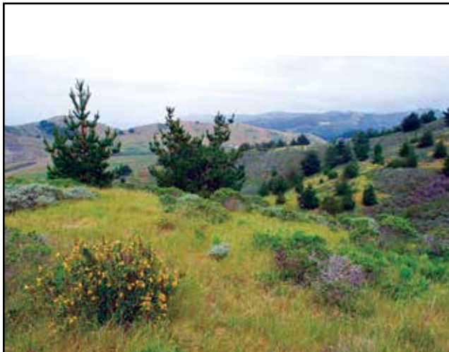
View north from south ridge of property

Please Note: Sketch plans are conceptual only. Neither the Seller nor its agents have submitted plan or made any applications to a public agency.