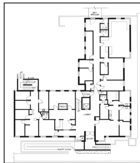
Basement Floor Plan

The office building, located at the corner of NE Fifth Street and N.E. Evans Street, was originally built in 1937 as a private hospital, and was then used for medical offices when it was renovated in the 1970s. The three-story building has a daylight basement with gross square feet of 16,455±, or 5,485± square feet per floor; it has 15,177± square feet of rentable space. There is one tenant on the second floor at a monthly rental of $1,971, with the lease term of October 31, 2013. (See Supplemental Information Package for detail on lease.) The building is on a 12,000± square foot site and has a common access drive with Yamhill County offices from NE Fifth Street, and a rear parking lot for four cars. The City of McMinnville has a newer two-story parking garage across the street.