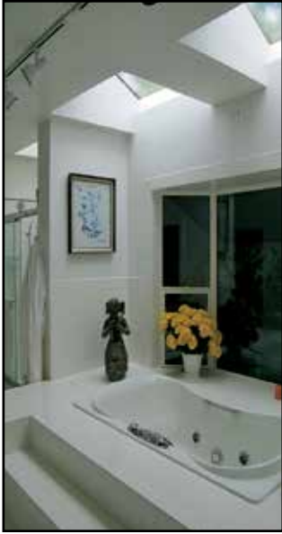
Soaking Tub and Porch off Master Suite