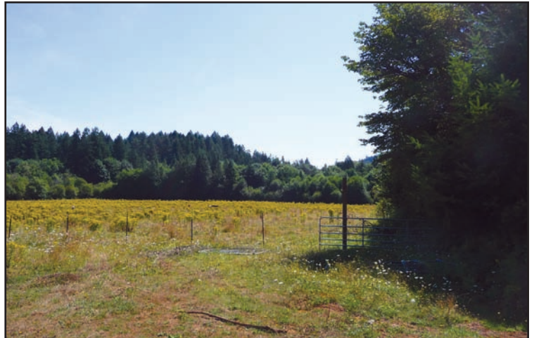
Meadow by homesite