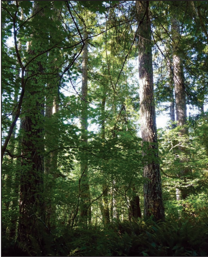
4,646± MBF of primarily Douglas-fir