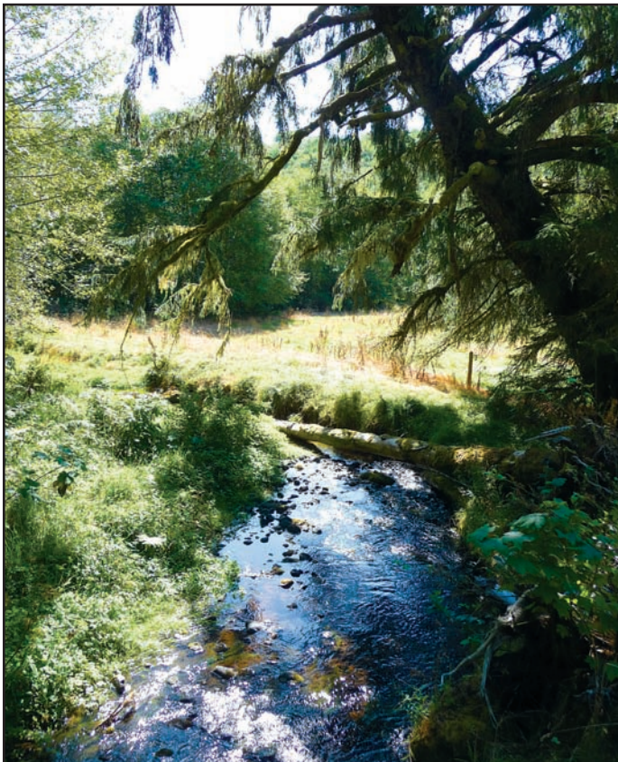
Wolf Creek instream and riparian enhancement project

land. There is good proximity to both domestic and import log markets along the coast, and to a high concentration of mills within the Willamette Valley.