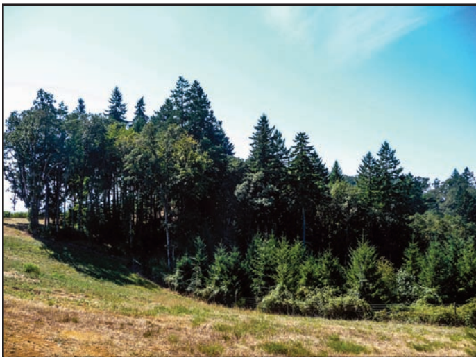
Top: View east from Parcel B (showing Mt. Hood on a clear day)