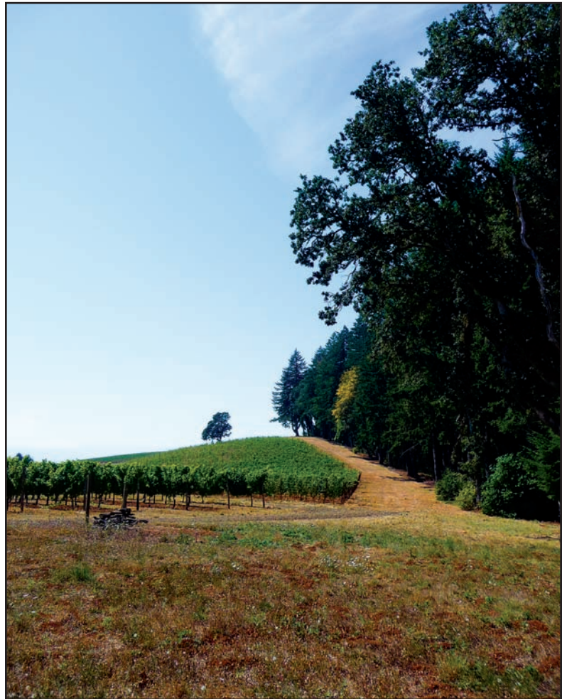
Hyland Vineyard is located along eastern section of Parcel B