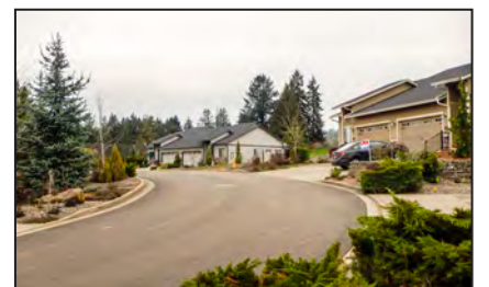
Auction #128 (4 Lots)