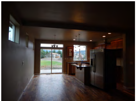
New Home - Great Room