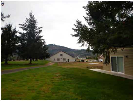
Auction #129 (4 Lots)