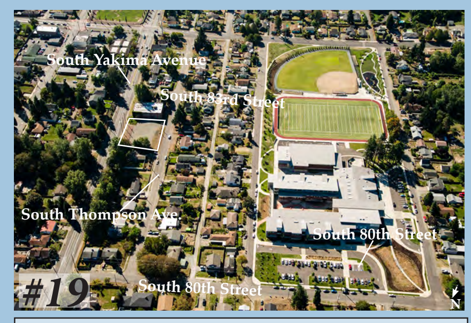
17,424± square foot multi-family infill development site in Fern Hill neighborhood, near library and new Baker Middle School in Tacoma. To be sold with No Minimum Bid!