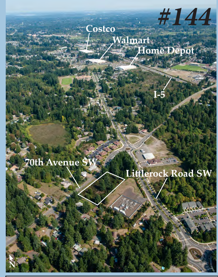
1.87± acre multi-family medium density development site, in Tumwater $325,000