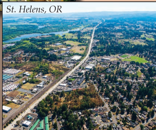
St. Helens, OR