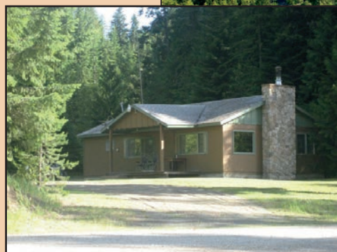
Shoshone County, ID