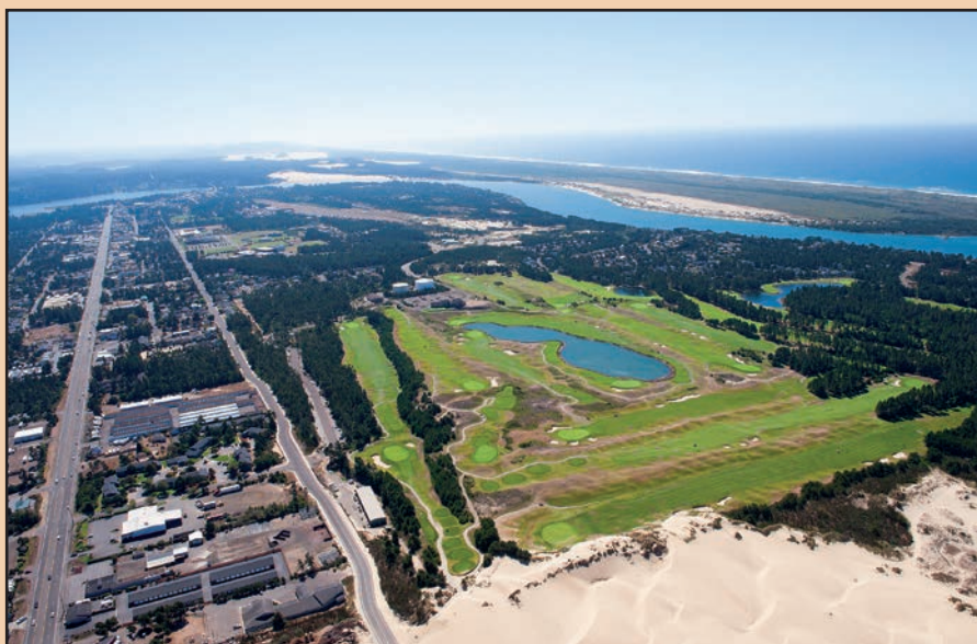
Sandpines Golf Links, Florence, OR