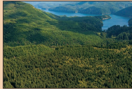
Skamania County, WA