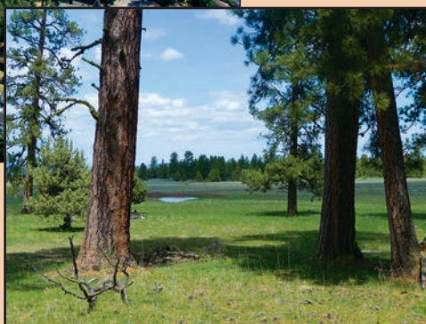
Grant County, OR