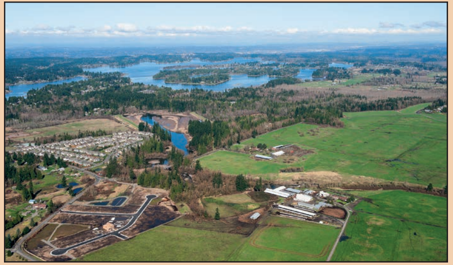
Lake Tapps, WA