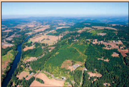
48± acres in Linn County, OR