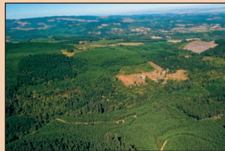
192± acres in Polk County, OR