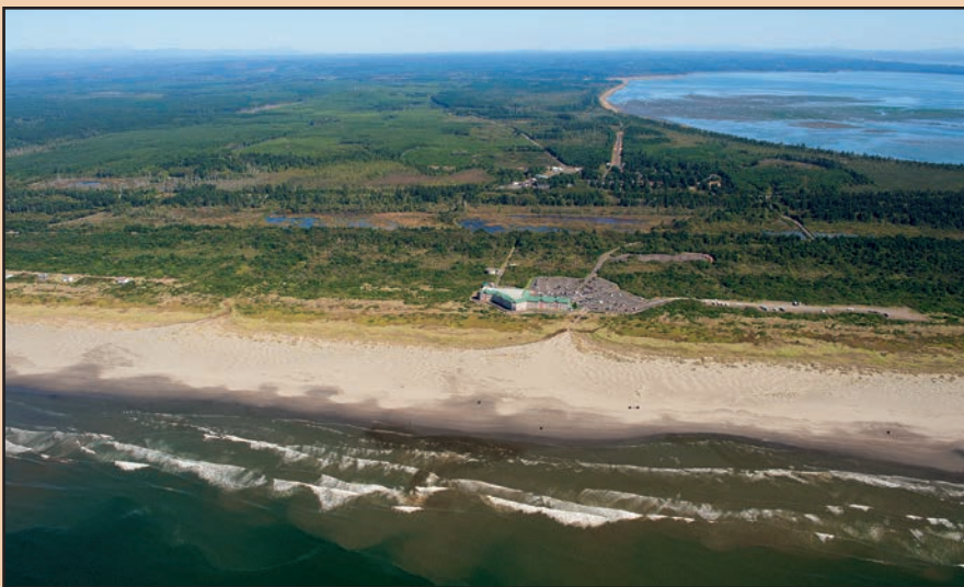
Ocean Shores, WA