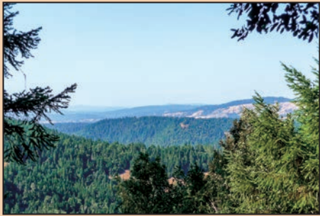
South Rancheria Creek, Mendocino County, CA