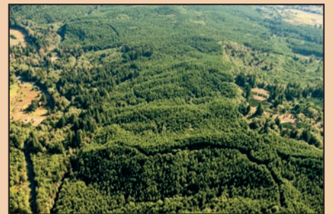
81± acres in Lewis County, WA