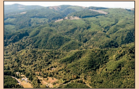
328± acres in Lewis County, WA