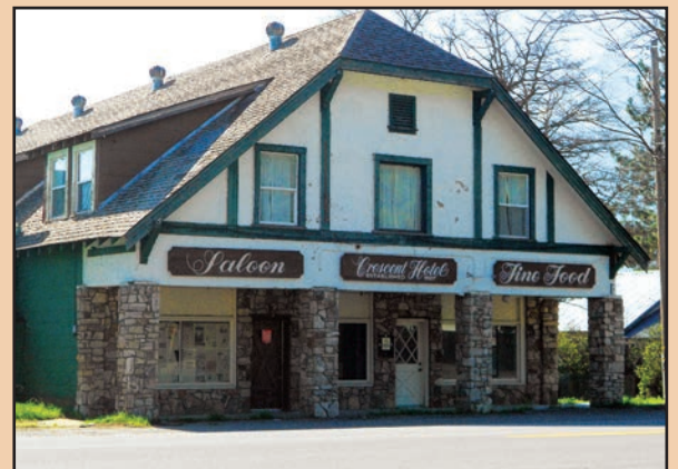
Crescent Mills, CA