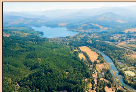
146± acres in Linn County, OR