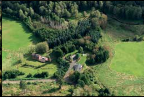
Stronghold Tree Farm