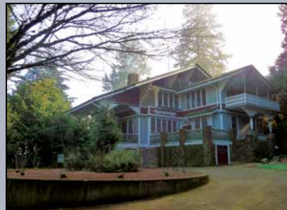
Restored Swiss Chalet