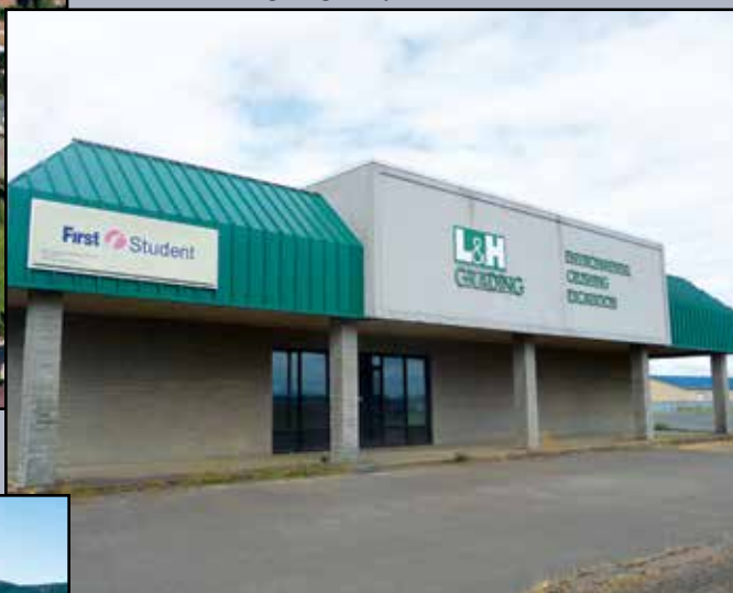
Warehouse along Highway 34 near Corvallis