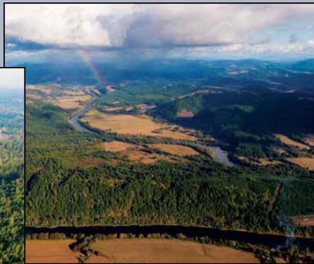
Umpqua River Valley