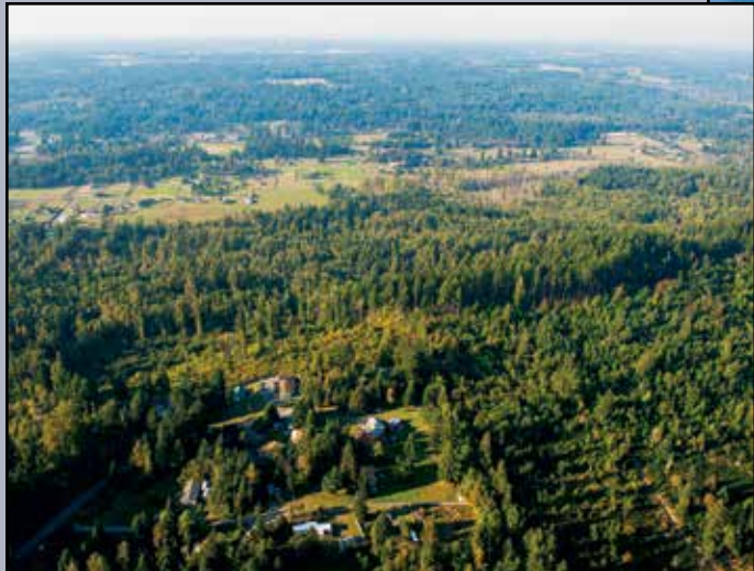
Pierce County, WA