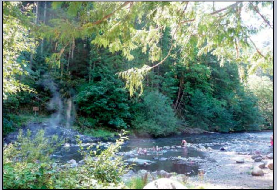
Austin Hot Springs