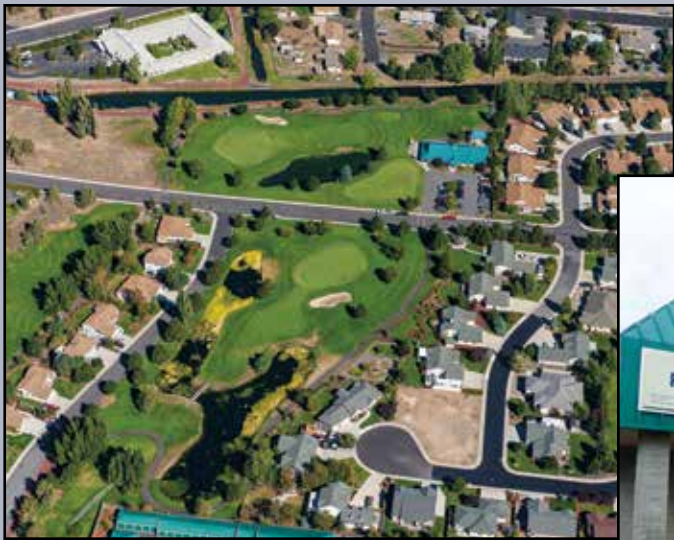
The Greens at Redmond