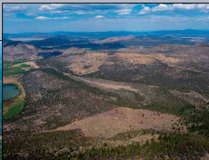
Klamath County, OR