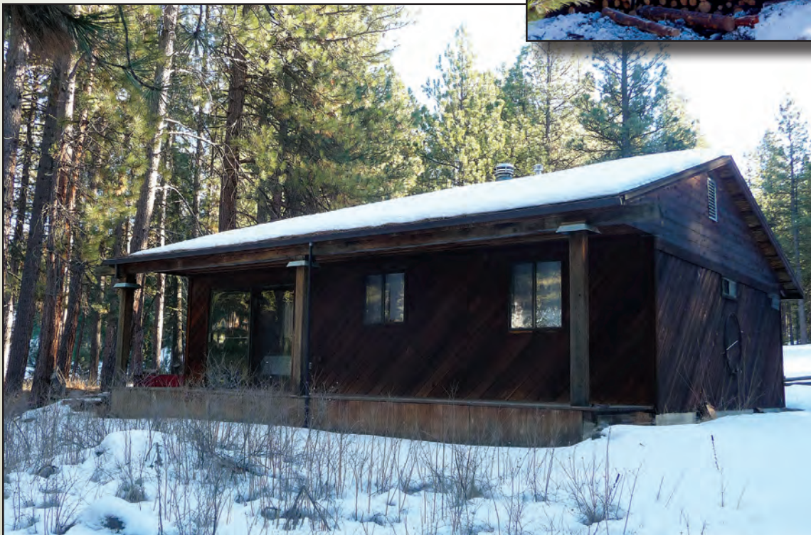
Two bedroom cabin located above Willow Creek

Excellent access from western section to Highway 26 and log and chip markets in Warm Springs, Hood River and Columbia Gorge