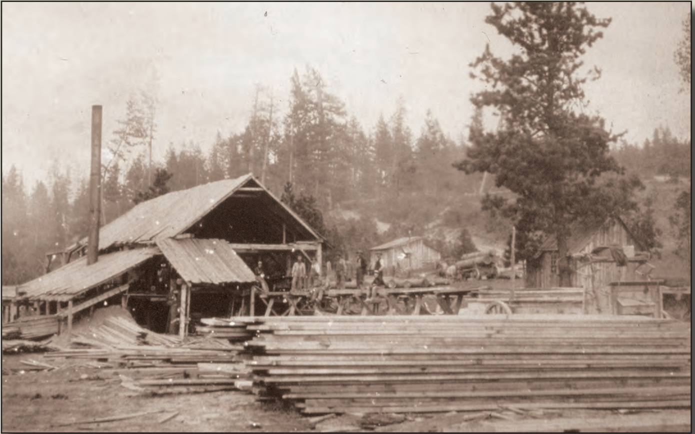
Sawmill along Willow Creek in the 1930s