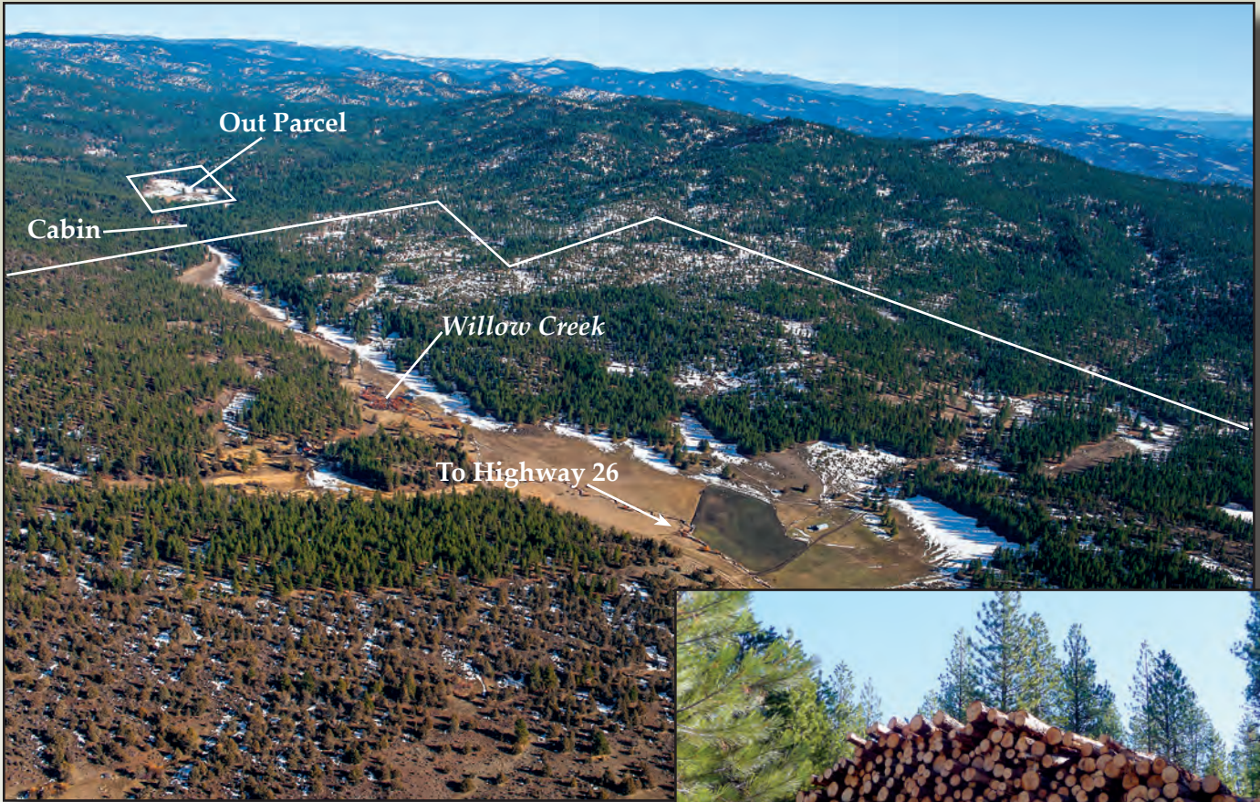
View west along Willow Creek